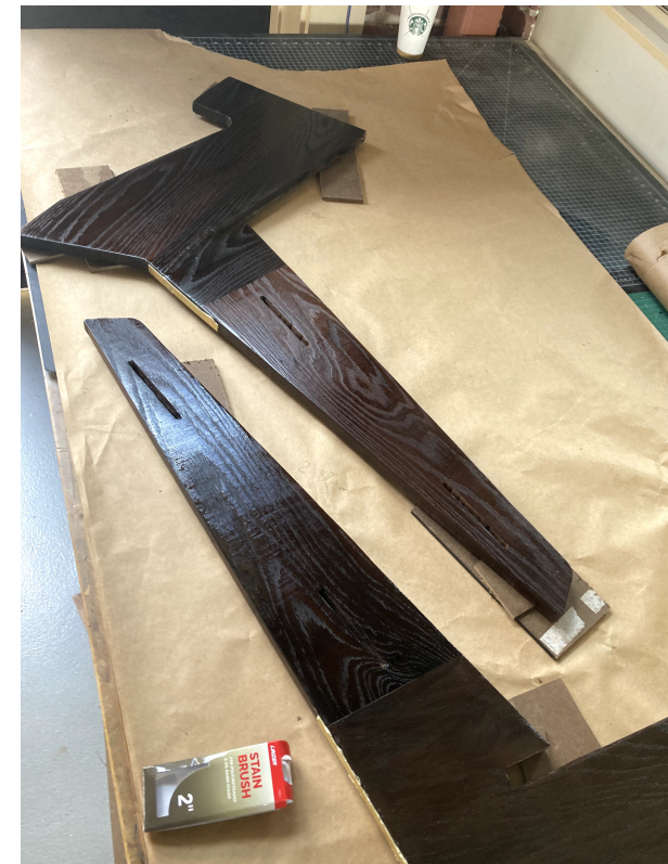
Staining and sealing final wood panels