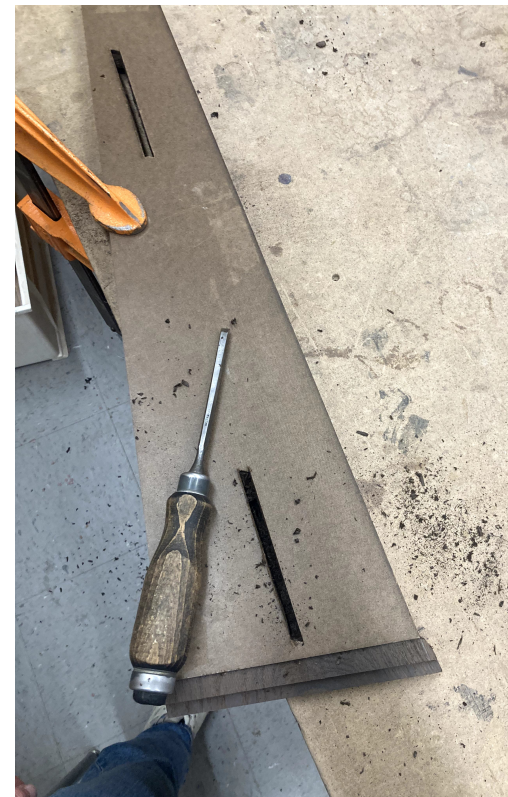
Laying on duron guide to chisel the fabric slots of the wood