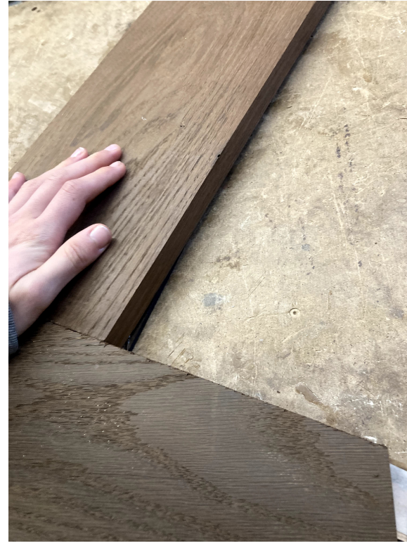
Creating lap joint of glue up