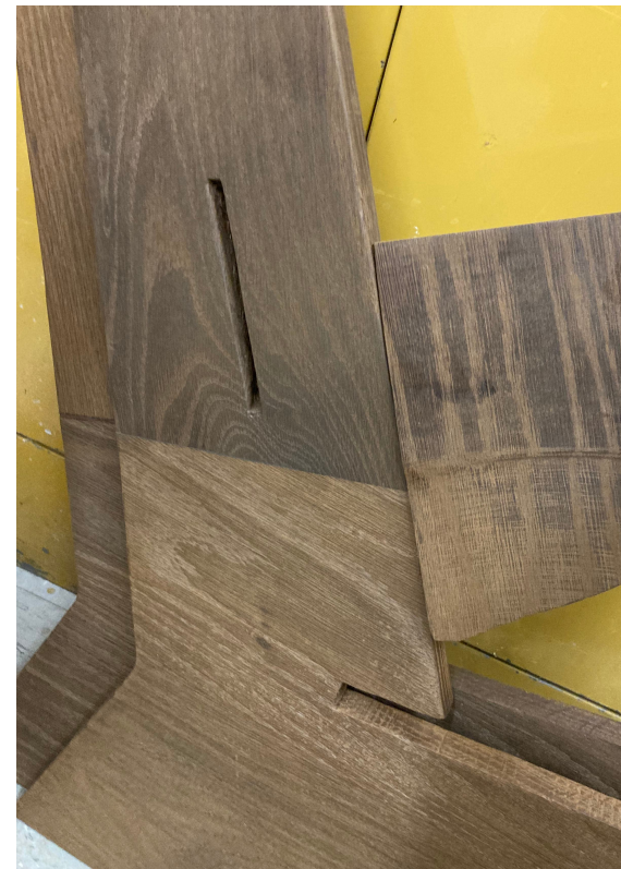
Color matching discrepancies in wood colors