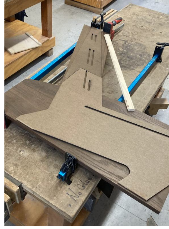
Laying out final chair profile, laser printed on duron