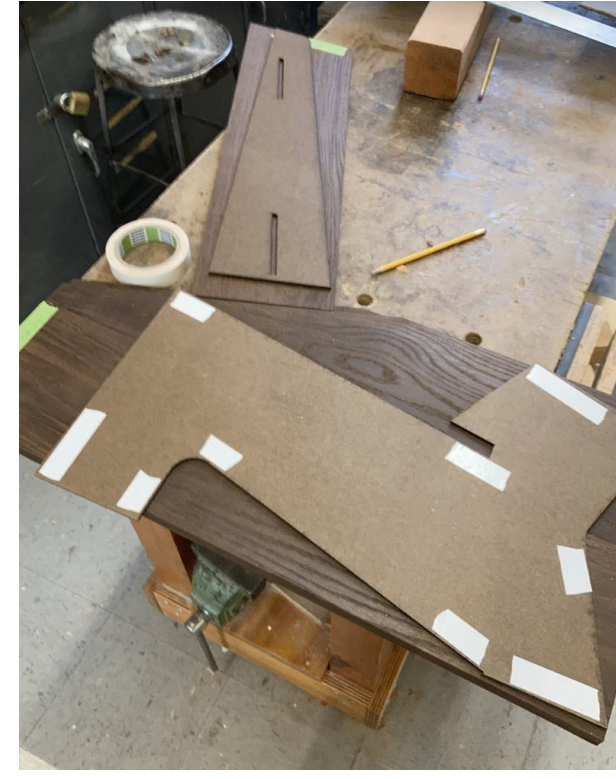
Machine taping duron guides to wood panels