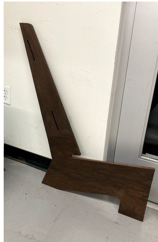
Staining wood to correct color matching