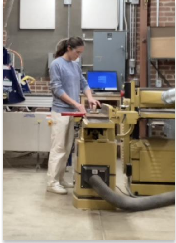
Planing all wood planks to equal heights