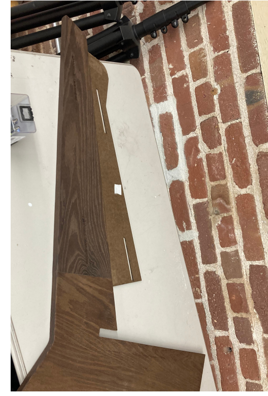
Table routing along duron guide the final chair profile